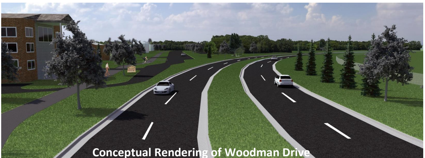
Conceptual Rendering of Woodman Drive