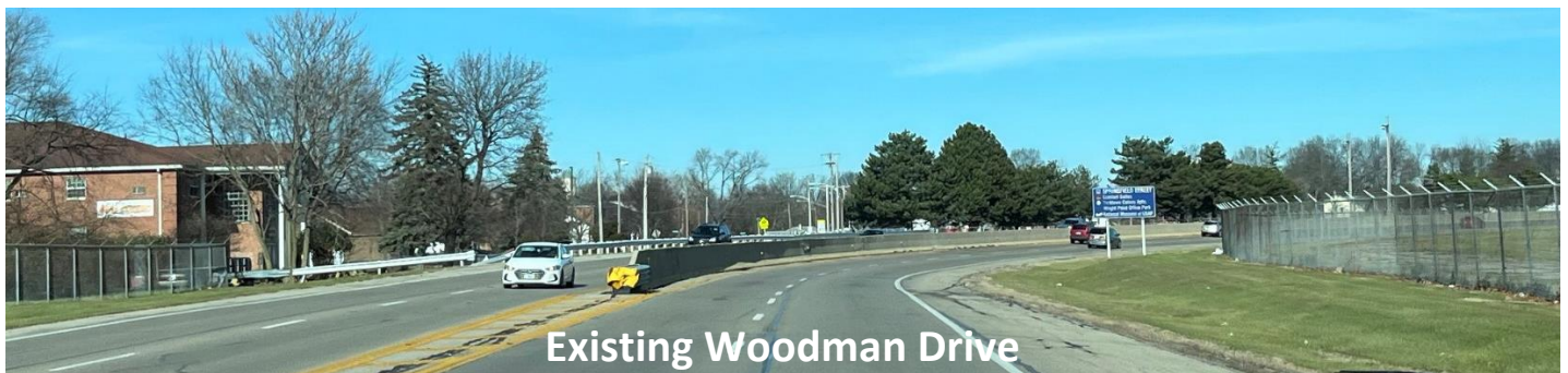
Existing Woodman Drive

The City of Riverside is seeking $1.5M to fund the final design of the proposed improvements for Phase 4.